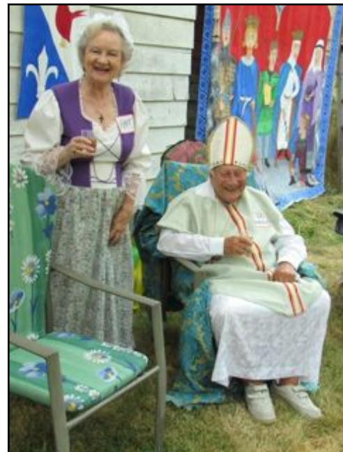
Our Heritage and our Culture Isn't it great to be British